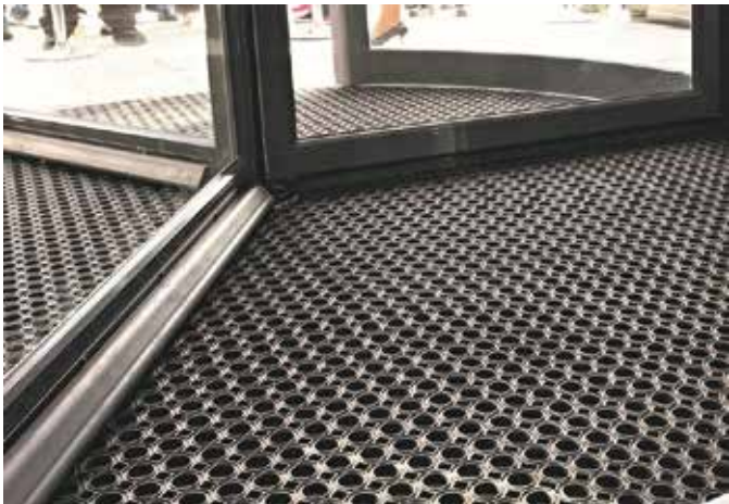
with rubber edge